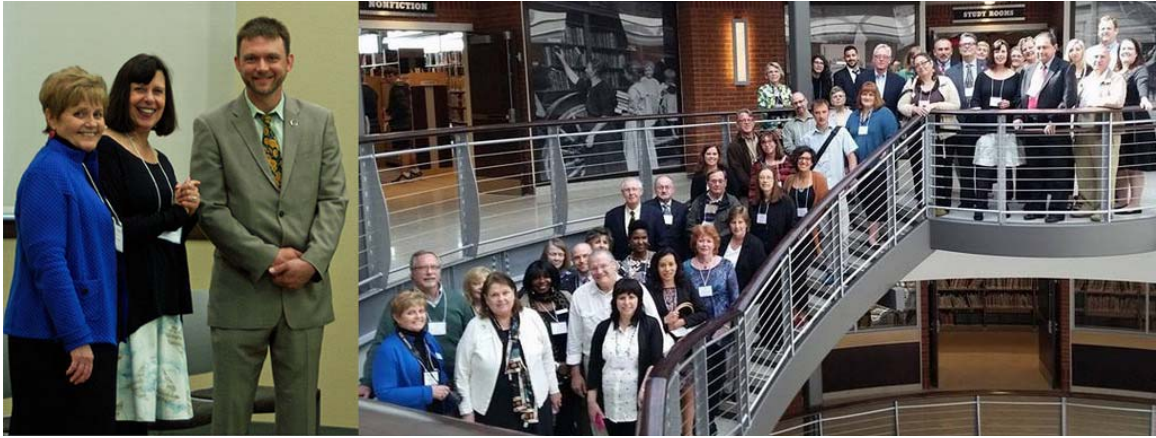
It was an honor for The Washington County Arts Council, Hagerstown A & E District, and the Washington County Free Library-Fletcher Branch to host the Maryland State Arts Council 2015 A & E Annual Meeting in Hagerstown on Monday, April 20, 2015. A beautiful day spent in the Hagerstown Arts and Entertainment District during the A&E District annual meeting.